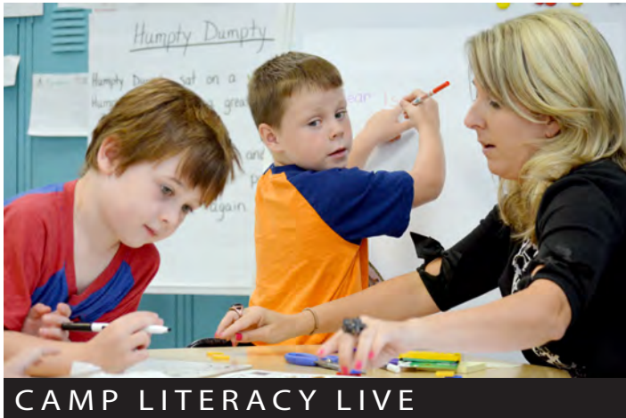
CAMP LITERACY LIVE

In July, 42 incoming 1st grade students attended Camp Literacy Live, a four-week intensive literacy intervention program. These targeted students receive reading instruction in the morning and engage in Kentucky Science Center camps in the afternoon. They're provided transportation, breakfast and lunch, all at no charge. Two parent workshops are also included. Thanks to the work of OCEF, this program is entirely funded by outside donations.