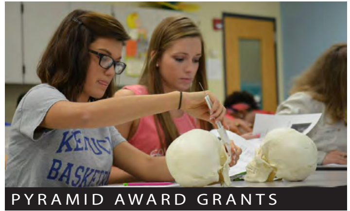
PYRAMID AWARD GRANTS

With support from OCEF and other community partners, the first cohort in the OCS Engineering Academy finished their year 1 courses. EngAc will expand this fall, with 46 students returning for year